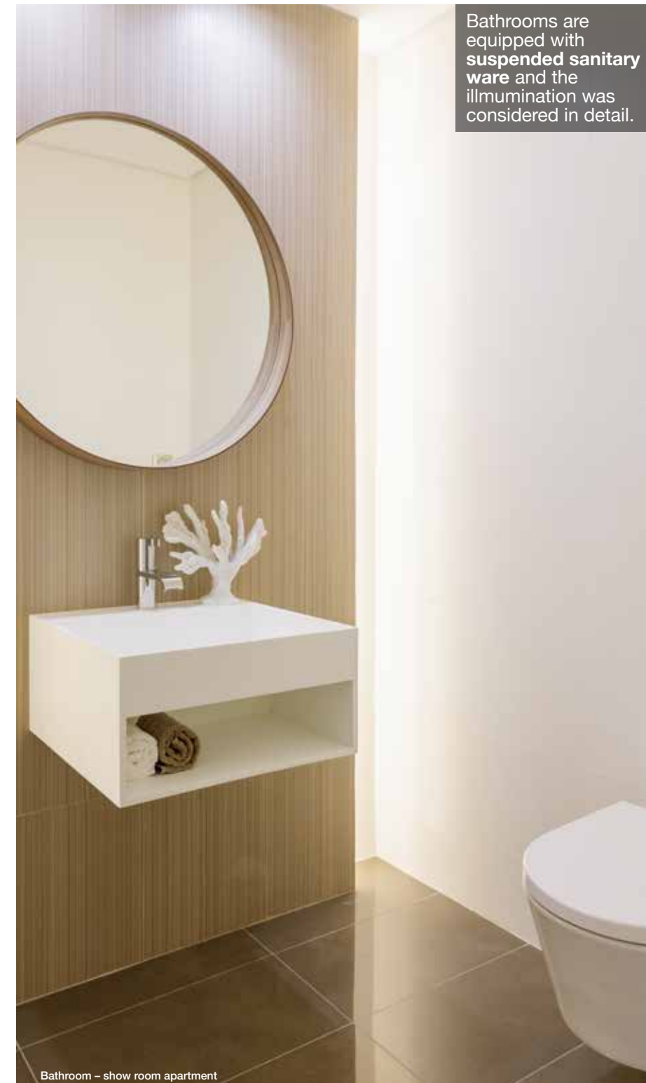
Bathroom – show room apartment

Bathrooms are equipped with suspended sanitary ware and the illumination was considered in detail.