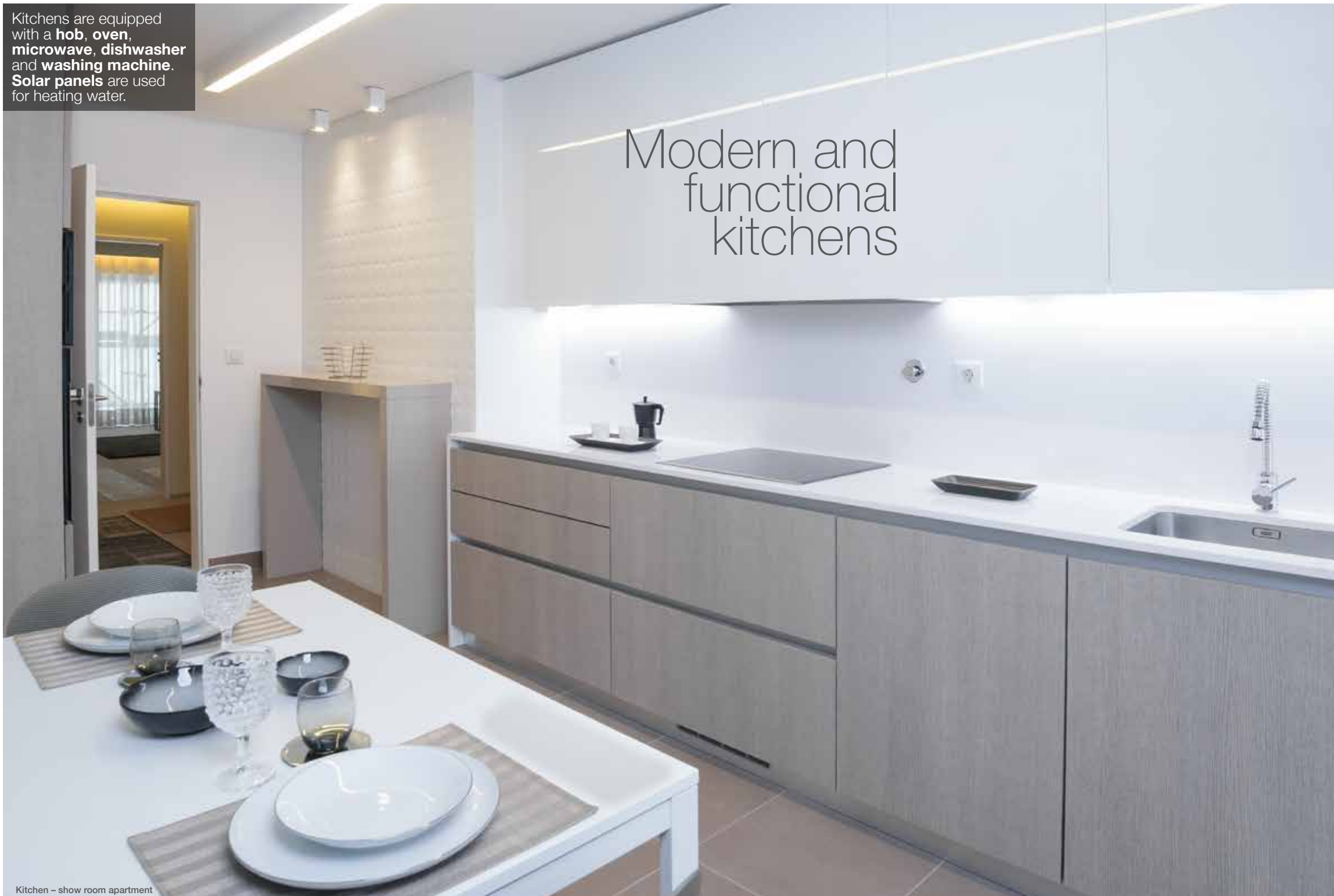
Kitchen – show room apartment

Bathrooms are equipped with suspended sanitary ware and the illumination was considered in detail.