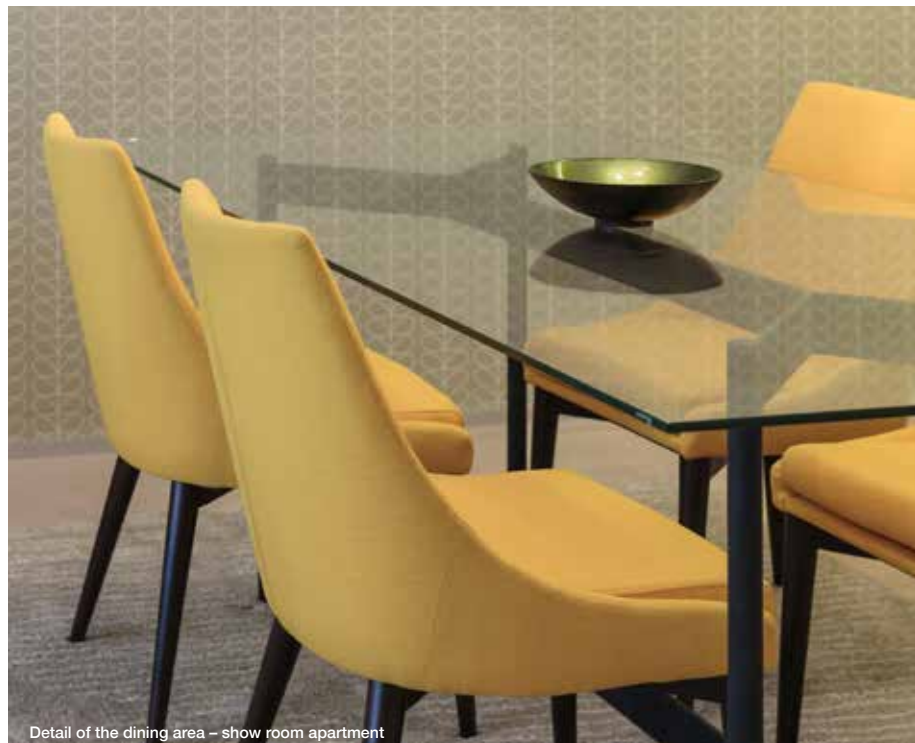
Detail of the dining area – show room apartment