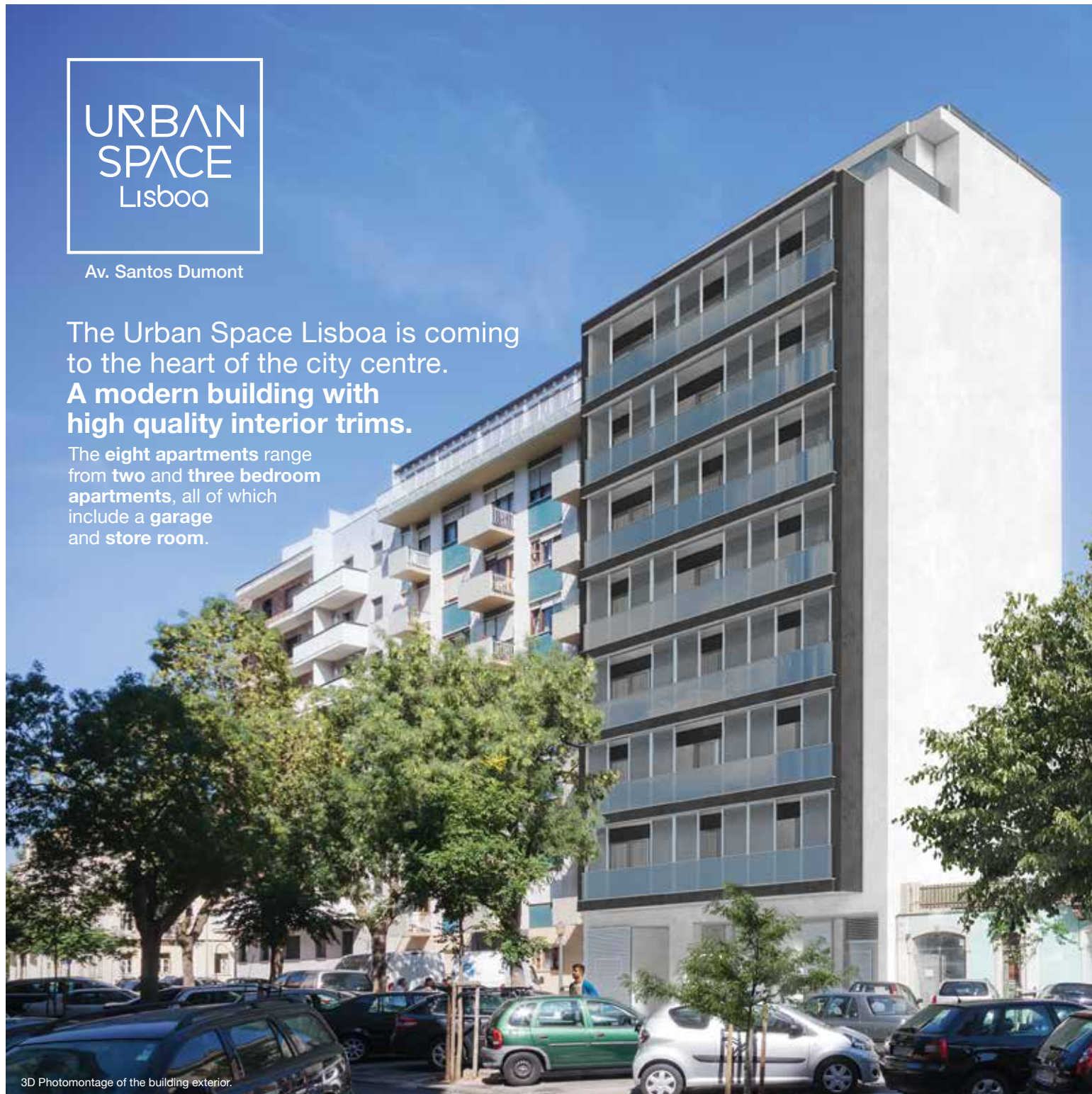
3D Photomontage of the building exterior.

The eight apartments range from two and three bedroom apartments , all of which include a garage and store room .