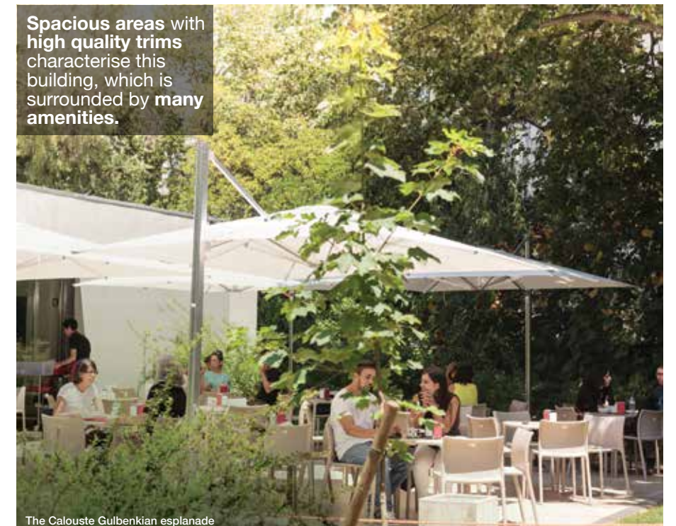
The Calouste Gulbenkian esplanade

Spacious areas with high quality trims characterise this building, which is surrounded by many amenities .