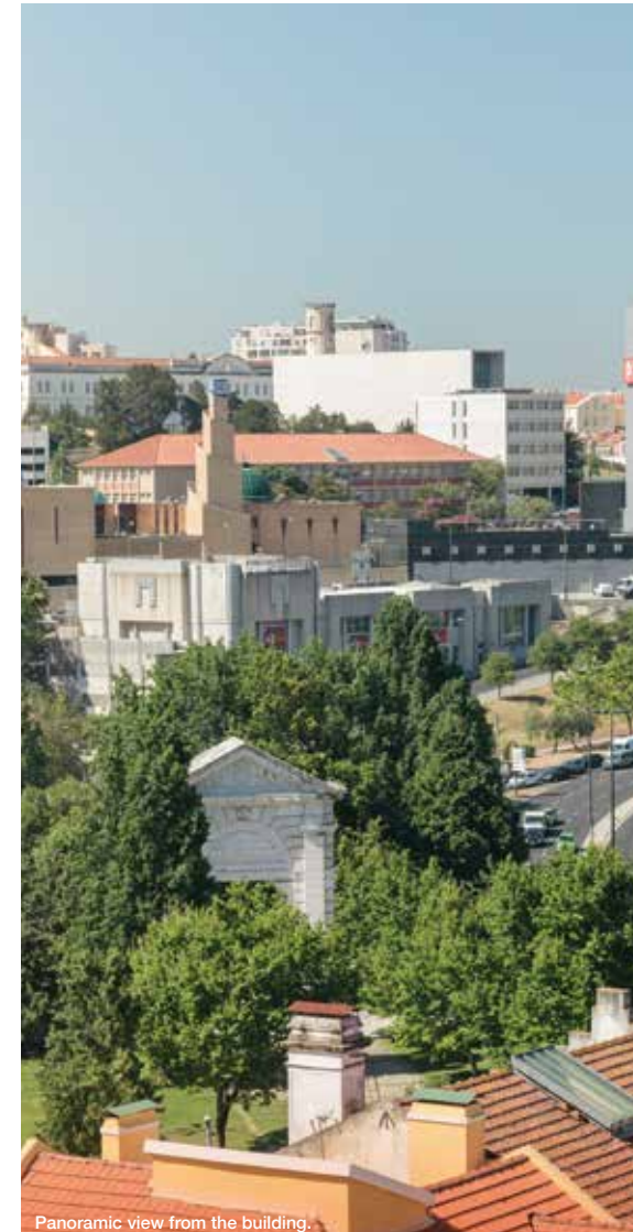
Panoramic view from the building.