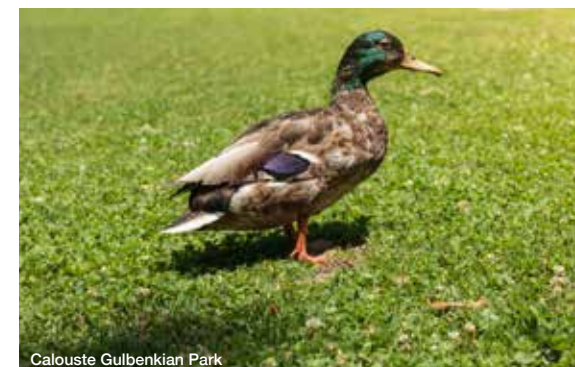
Calouste Gulbenkian Park